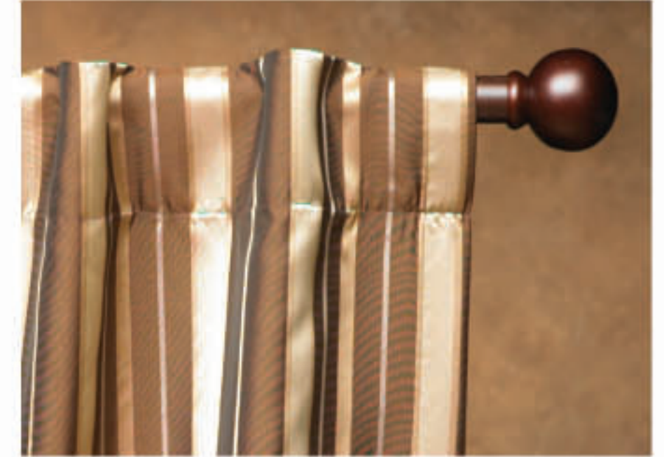
Back Tab/ Design Tab