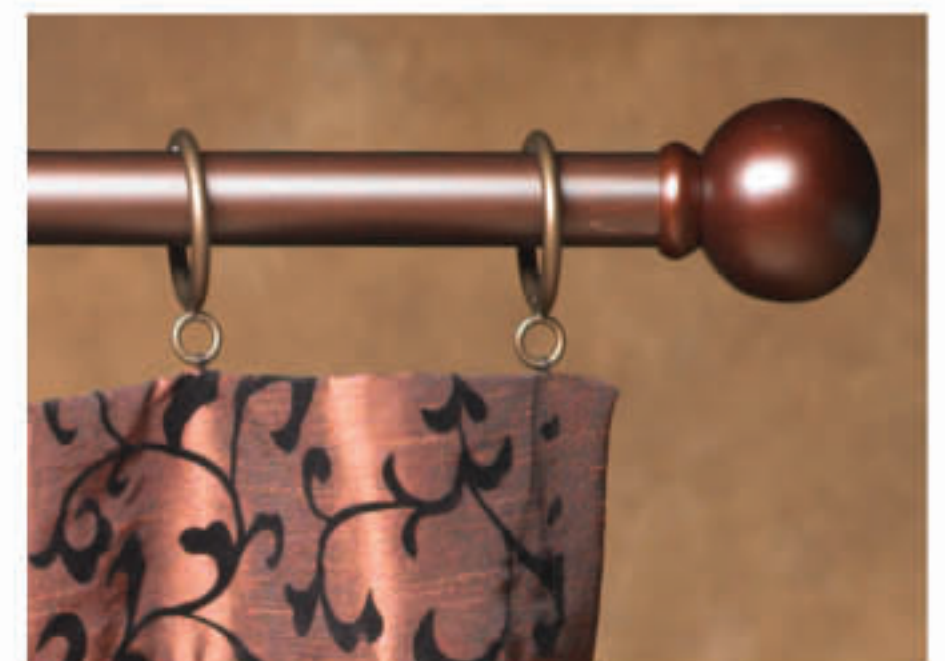
Ring Top/ Sewn