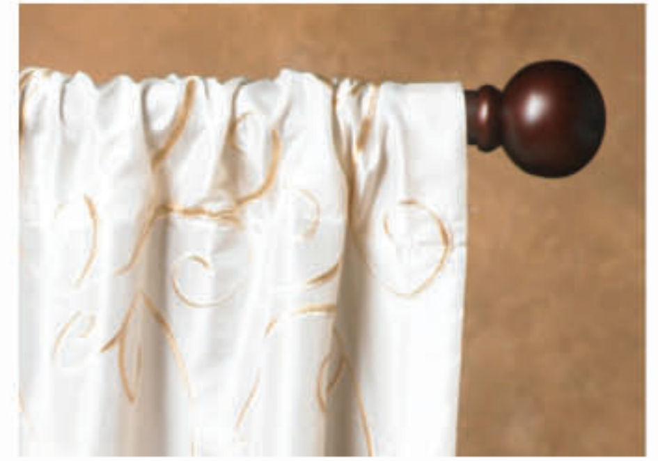
Rod Pocket (no header)