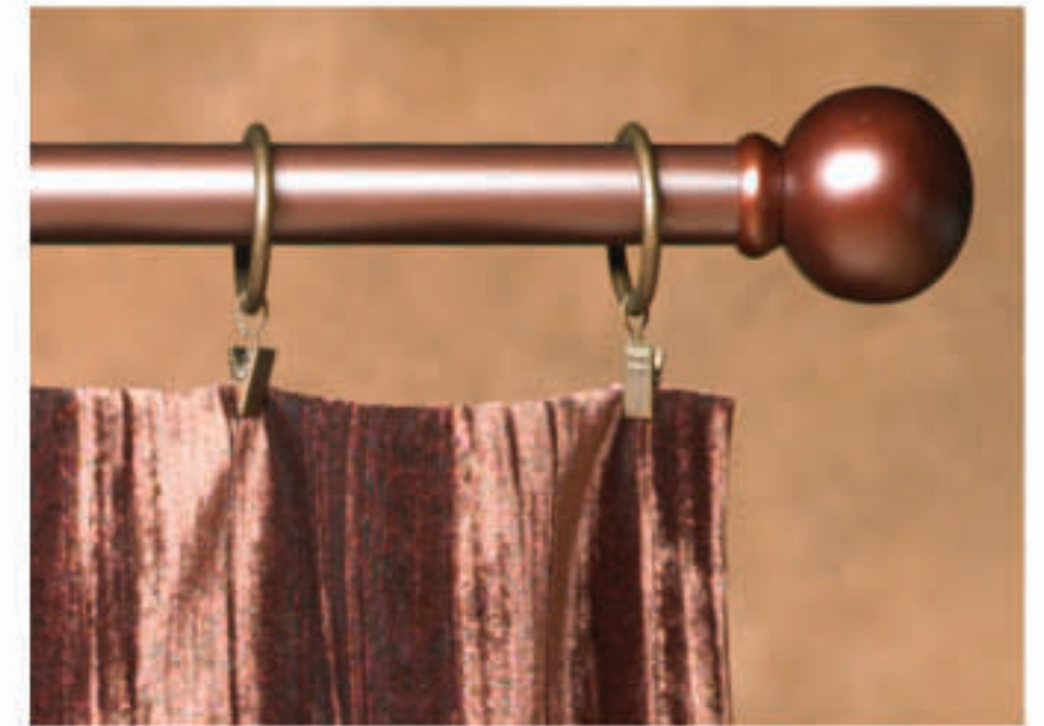
Ring Top/ Clip